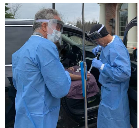
Ozone Therapy being administered to a COVID patient in Michigan

More reports are needed to confirm the promising results of ozone therapy against COVID-19. Preliminary data suggests significant effectiveness against the mechanisms of the infection.